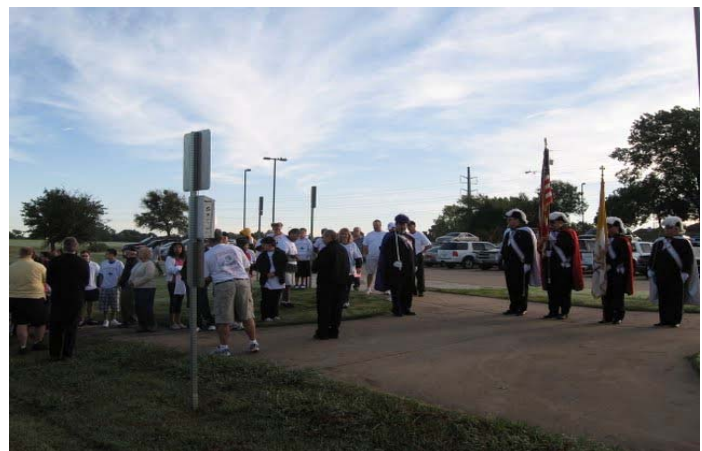
The Knights Color Corp was at the Hike for Life-Richardson to kick off the event.